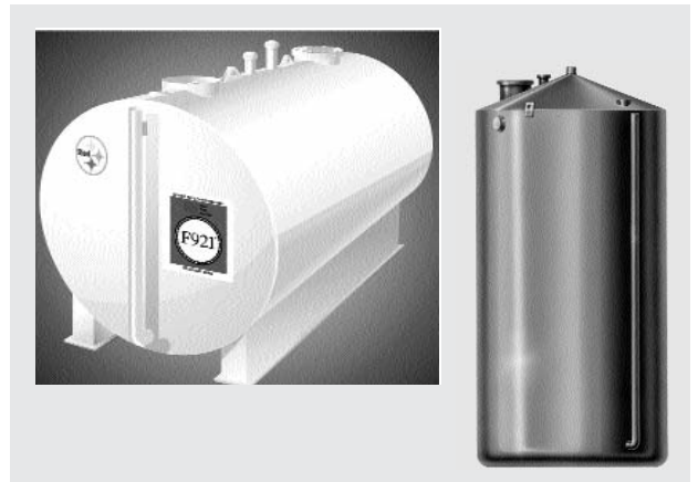
Economical Double-Wall Design